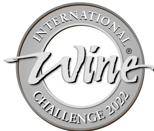
Dated Master Logo